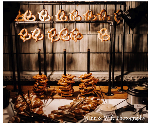
Mann & Wife Photography