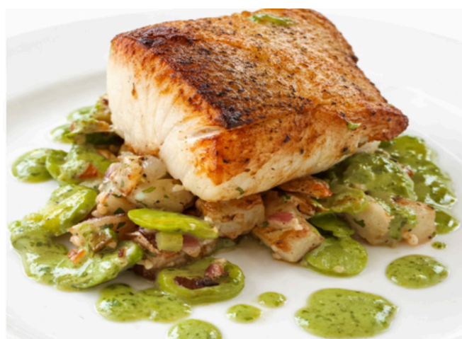
Chilean Sea Bass à la Nage