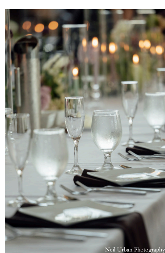
Neil Urban Photography