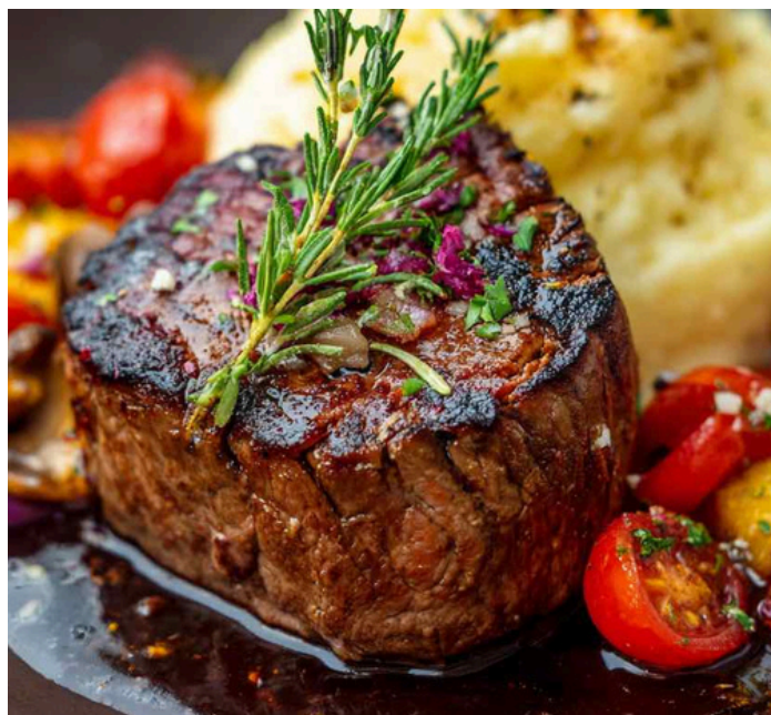
Center Cut Filet Mignon