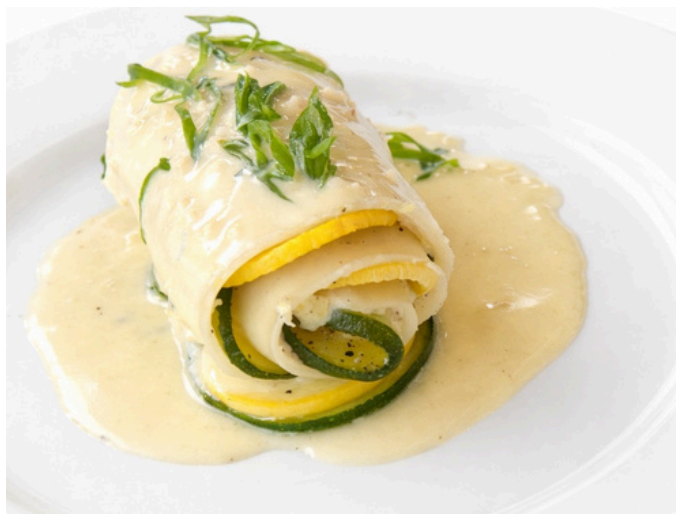
Ricotta and Summer Squash Rotolo

Four jumbo shrimp gently sautéed in compound butter with notes of garlic, parsley, and lemon